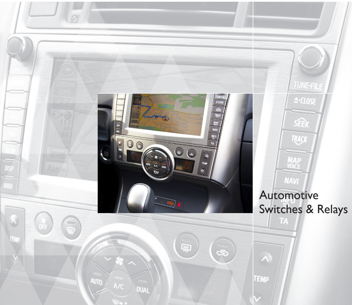
Automotive Switches & Relays