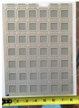
Array of photoetched AlSiC lids.