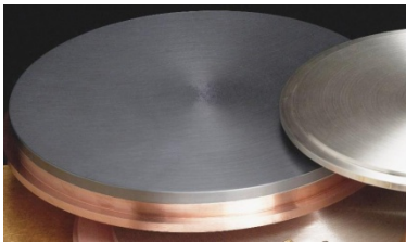
Sample Sputtering Target lots.

All sputter targets and evaporation sources contain impurities. It is neither practical nor economically feasible to manufacture 100% pure materials. Understanding how pure a material is, how to interpret material impurities quoted, and which impurities are important to a particular application is critical in selecting materials and for ensuring processed stability over multiple