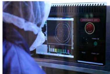
Operation of the KLA-Tencor Surfscan 6420