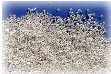
Silver Casting Grain

One of the key ingredients to producing the highest quality silver finished parts for our customers is to begin with the best possible starting material. Materion's refining methods for silver remove or lower elements that negatively impact the casting process. Our Best Practices ensure that silver content is met, impurities are kept out of the process and oxygen is reduced to a low level.