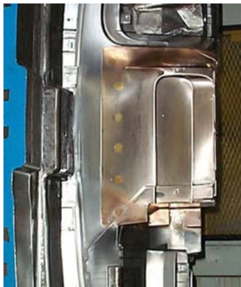
Central core insert of MoldMAX XL. This tool has over 350,000 shots and has been a trouble free workhorse for Textron.