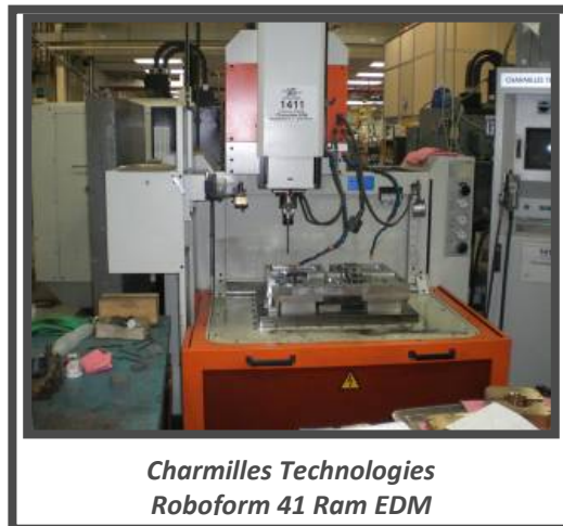
Charmilles Technologies Roboform 41 Ram EDM

Read the SDS specific to the products in use at your facility for detailed information on the health effects of exposure to beryllium.