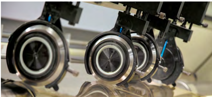
Precision converting of custom thin film-coated web.