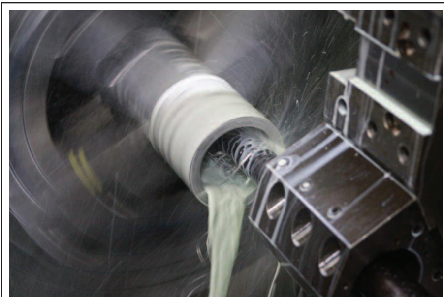
The new copper-nickel-tin alloy tempers achieve good longitudinal and transverse properties at larger diameters, and they can be manufactured as hollow bars directly off the mill, offering significant cost savings by eliminating the need to machine the core from a solid bar.