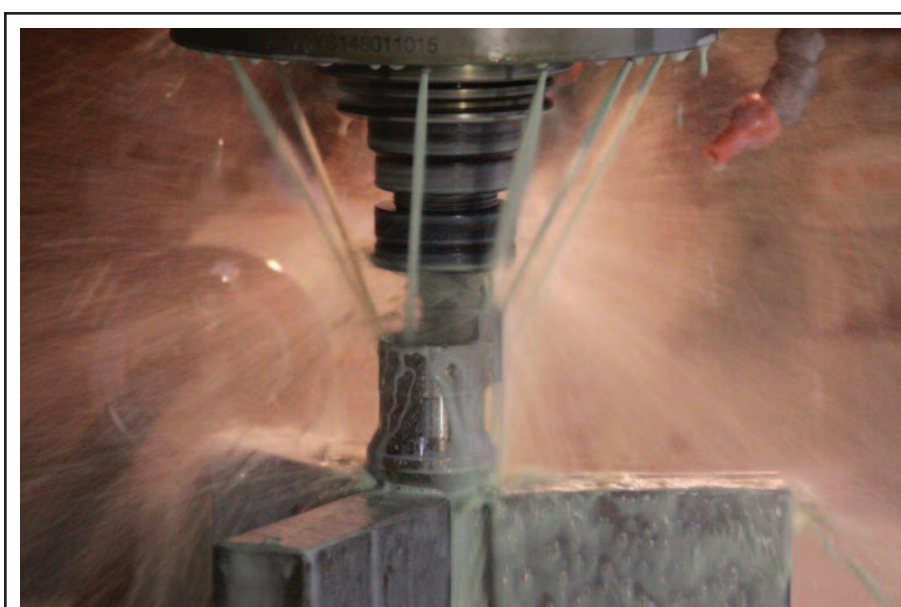
In response to the ever-increasing demands inherent in today's field applications, legacy C72900 alloy has been re-engineered with next-generation capabilities to give engineers and designers new capabilities while also providing cost-saving opportunities. The new tempers provide increased fracture toughness without sacrificing strength.

The radius that can be deployed, and drilling from the vertical section to the horizontal leg, is much sharper than what could be achieved in the past. Essentially, the new alloy means that the horizontal wellbore can be placed into the pay zone