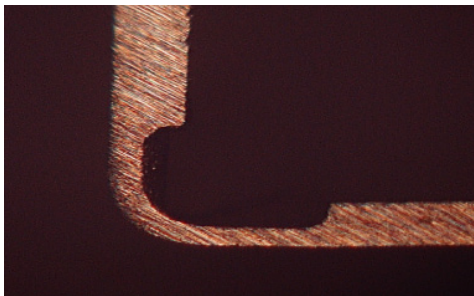
Reduce Bend Radius Clearances

Create Ductile and Spring Hard locations side by side in 500 kg coils!