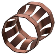
High Performance Alloy, Supported Arch Insert for Round Pin Terminal

The larger body of the connector terminal, that houses the contact spring, can be produced from more ductile, crimpable, commodity copper alloys for cost control. Round and flat blade pins in a range of sizes can be engineered in two-piece designs. The active elements of the spring insert can be an arch, torsion beam or a tapered cantilever beam. Examples are shown below. Plating of the spring at the contact interface can further improve connector performance and reliability.